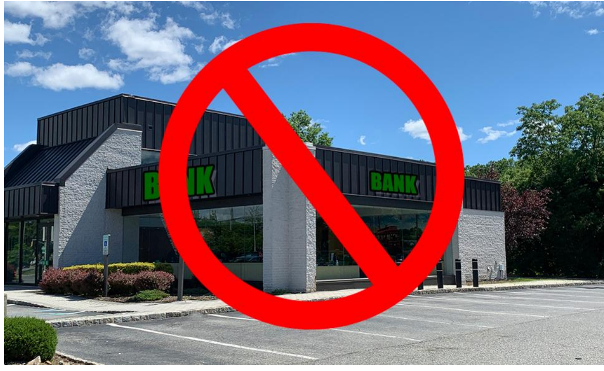
It doesn't necessarily make sense for a landlord to provide a free loan to its tenant. RANJAN SAMARAKONE

After reading the letter, the landlord opened a conversation with the tenant, which was actually just a single-location subsidiary of the large company that sent the letter.